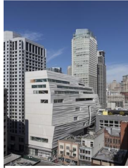
Perhaps the most powerful example of what composite materials can achieve; the most recent addition to the SanFran MOMA. The façade is entirely made of FRP.

safety from flame or fire retardant additives can be mixed into the resin; in addition, the plastic component can be made any color or variety of finishes. The water-resistant nature of FRP makes it a great option for areas with high moisture, or exterior applications. The strength and durability makes it a suitable replacement for drywall or wood solutions to wall coverings, even more so due to the water resistance. The flexibility of FRP enables it to become or serve just about any function in a building system. Just like wood can manipulated into just about any shape or form, FRP follows suit. Applications range from wall systems, facades, connectors, insulators, sun shades, and much more.