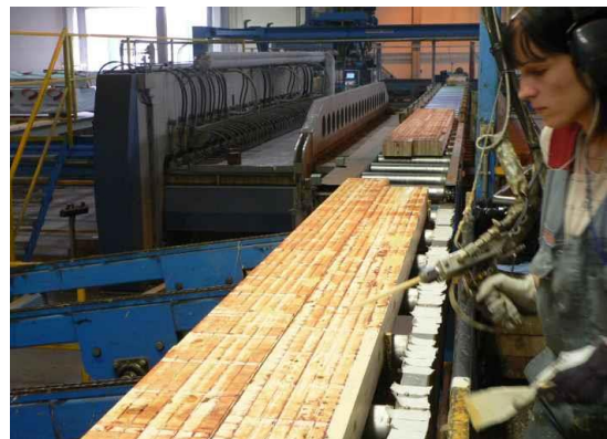
Above is depicted a woman applying sealant to a beam that has already been assembled. Note how the beam is just a composition of layers of dimension lumber.

Wood-Plastic composite is the technical term for composite decking. Straying a little further from natural solutions, these durable and water-resistant boards are made by combining finely ground wood and a thermoplastic; a group of plastics that includes PVC. After the plastic hardens, the resulting product is stronger than any wood boards of the same size and they will last nearly twice as long with no