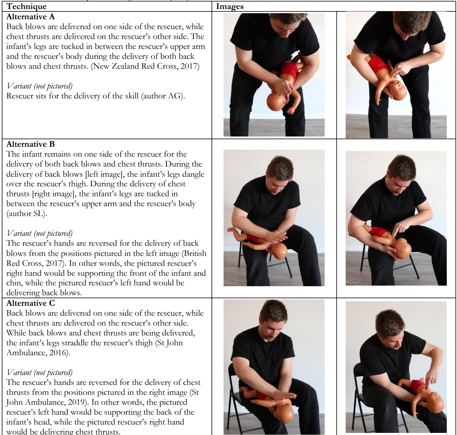
Table 2: Alternative techniques to relieving FBAO in infants found in the review.