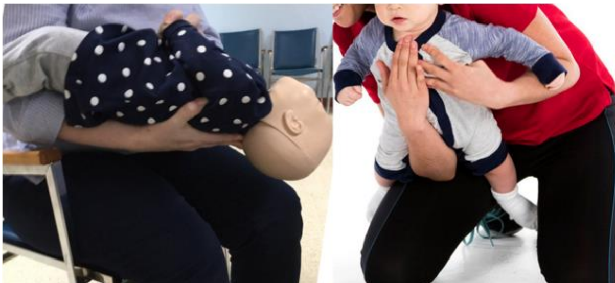
Figure 2: On the left, shows a rescuer who is unable to support the head of an infant mannequin in order to deliver chest thrusts while having the infant's legs straddling the rescuer's arm. On the right, shows a case where the rescuer is unable to support the head of the infant in preparation for the delivery of back blows.

In this case, an infant is defined as “anyone younger than 1 year” (Standards & Guidelines, 1980). The same version of Standards & Guidelines noted the technique, as described, may not be physically possible in all cases: