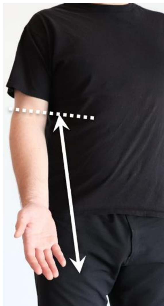
Figure 4: Ideal measurement relevant for straddling the infant: the inside elbow crease to the tip of the longest finger.