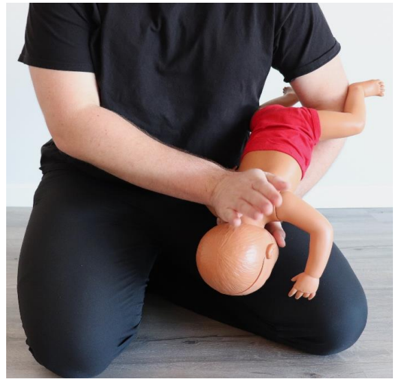
Figure 1: The practice in question: the infant's legs are straddled on the arm of the rescuer during the delivery of back blows and chest thrusts in an attempt to relieve a Foreign Body Airway Obstruction (FBAO).

well as a CINAHL search using keywords infant AND (foreign body airway obstruction OR foreign-body airway obstruction OR FBAO).