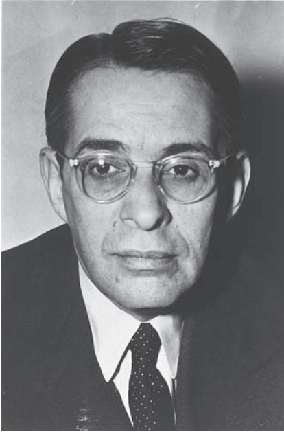
Colombian president Eduardo Santos (1938–42). A strong proponent of Colombian-American cooperation, President Santos, pictured here in 1948, guided Colombia through the opening of World War II.

that demanded further inter-American collaboration. Conversely, President Santos detested foreign totalitarianism, the ideas and actions of which were incompatible with Colombia's republican principles. In November 1938 Adolf Hitler's Nazi Party mistreated three Colombian diplomats for collecting information on anti-Semitism in Germany. The entire incident merely reinforced the Colombian president's low opinion of the Nazi government. 15 These convictions shaped Colombian foreign policy and determined Colombia's position at the December 1938 Lima Conference.