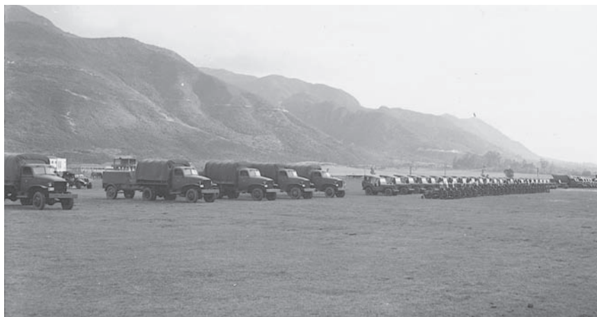
U.S. Army Lend-Lease motor vehicles outside Bogotá, 1943. Colombia did not take full advantage of the Lend-Lease program. Still, it acquired modern U.S. military equipment, for the first time, during World War II.

and M-31 carbines) during World War II. 104 The republic also received U.S. military uniforms. Colombian soldiers gradually replaced their prewar Prussian-style headgear with American helmets, a visual representation of the army's new orientation toward the United States. Most of the equipment, including helmets, arrived after Colombia's 1943 recognition of belligerency with the Axis, when Colombia began to play a more active role in Caribbean defense, but after the real threat to the region passed. 105 As the war drew to a close, Colombia also received some U.S. supplies under the Surplus War Property Disposal Act, although most of those items were nonlethal. 106 Compared to Britain and the Soviet Union, Colombia received a negligible amount of Lend-Lease materiel. Together, the Latin American republics received less than 3 percent of the wartime equipment distributed by the United States, with Brazil (Washington's closest ally) taking 75 percent of the region's total allocation. 107 Still, Lend-Lease assistance introduced Colombians to modern U.S. military equipment, which they would rely upon in the years ahead.