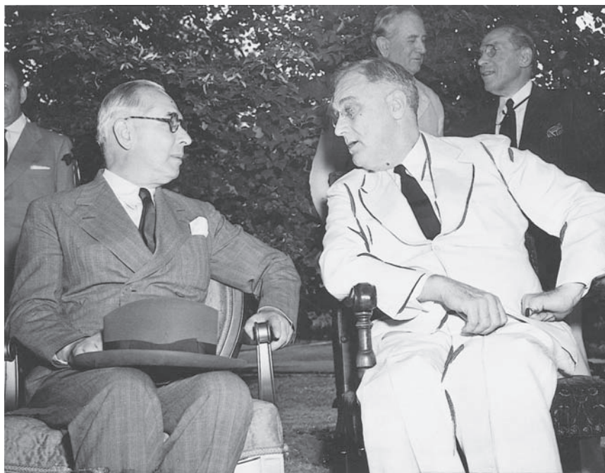
Colombian president-elect Alfonso López (1934–38, 1942–45) confers with President Franklin D. Roosevelt (1933–45) on the White House lawn, July 1942.

officials of his goodwill and support. The discussions convinced U.S. policymakers that the bilateral partnership would continue. The trip did nothing to end the political fighting that would carry Colombia into World War II. 37