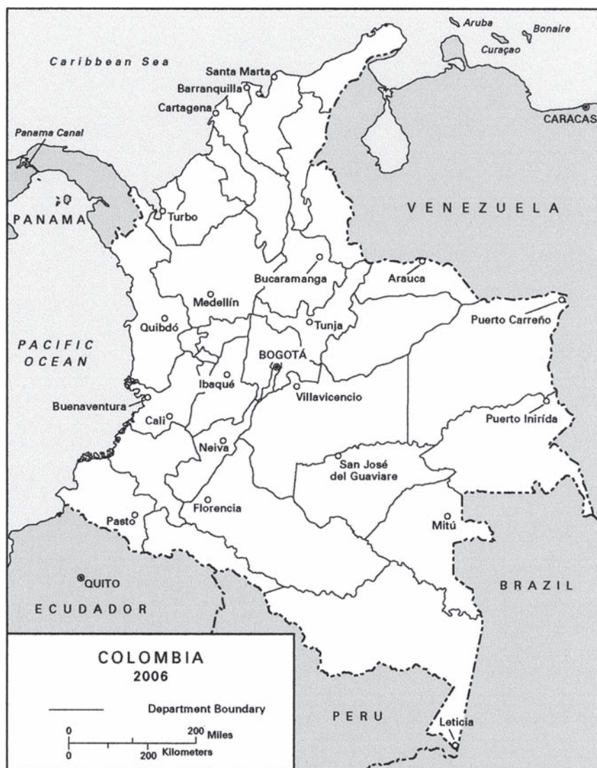
Political Map of Colombia

this study, comparative vignettes complement the international approach. Combining military and diplomatic history, it explores U.S.–Latin American relations, multinational coalitions, and international conflict through the intensive examination of U.S.–Colombian cooperation. Also, since Colombian and U.S. officials frequently connected hemispheric defense with Latin American internal stability, domestic law enforcement, and modernization, this study pursues a broad definition of security relations. By extension, it devotes attention to Colombian national history, particularly the intense political, social, economic, and religious convul-