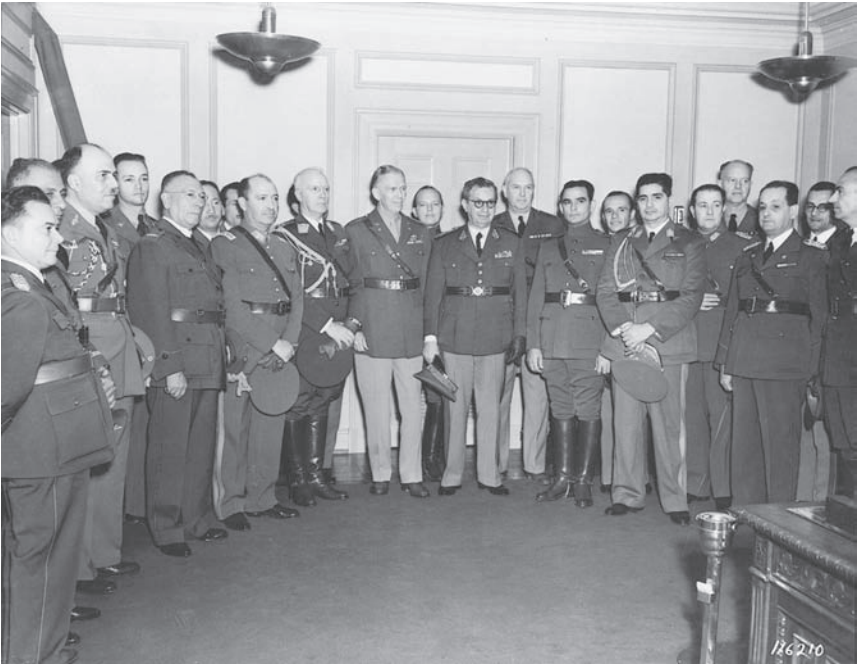
Latin American military leaders visit U.S. Army chief of staff General George C. Marshall in Washington, October 1940.

U.S. government, unsure on the exact course to follow, mixed the two approaches. The State Department promoted international cooperation in various diplomatic settings while the U.S. military started building a network of bilateral relationships. Then, just before the 1942 Rio de Janeiro Conference, President Roosevelt expressed his preference for bilateral tactics. He wanted diplomats to create an Inter-American Defense Board but insisted that it serve only an advisory role. That decision accounted for the relative inactivity of the board during (and after) World War II and smoothed the path for the U.S. government to pursue its security goals in Latin America through bilateral arrangements. 56 The United States worked directly with individual countries to achieve stated objectives. In Colombia, U.S. officials encouraged the development of a military establishment capable of repelling “any probable minor attack from overseas.” 57